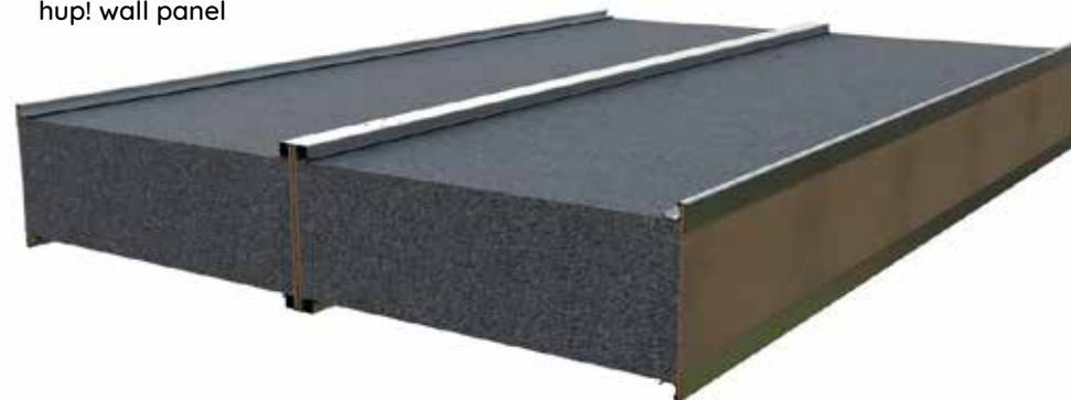
hup! wall panel

Your hup! walls are made with Ultrapanel which are the reason for the speed of a hup! build – you may have seen them arrive at your home already cut to size and then be simply clipped together. Ultrapanel is a precision engineered combination of timber, steel and insulation and when clipped together, they create an incredibly strong I-beam structure which gives hup! walls their exceptional strength.